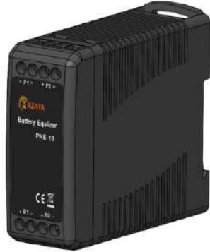
Battery Equalizer PNE-10 User Manual